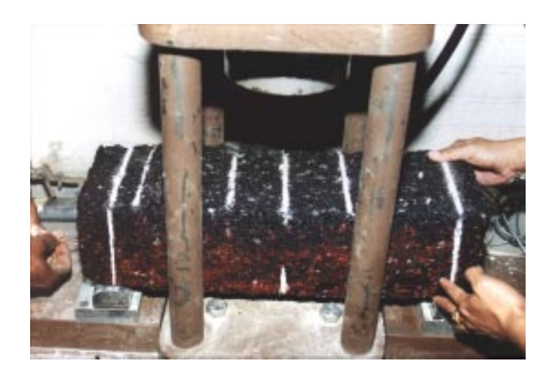
Testing of Smart Material with Low Cost Sensor